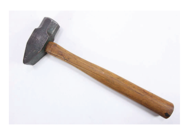
Cross peen hammer