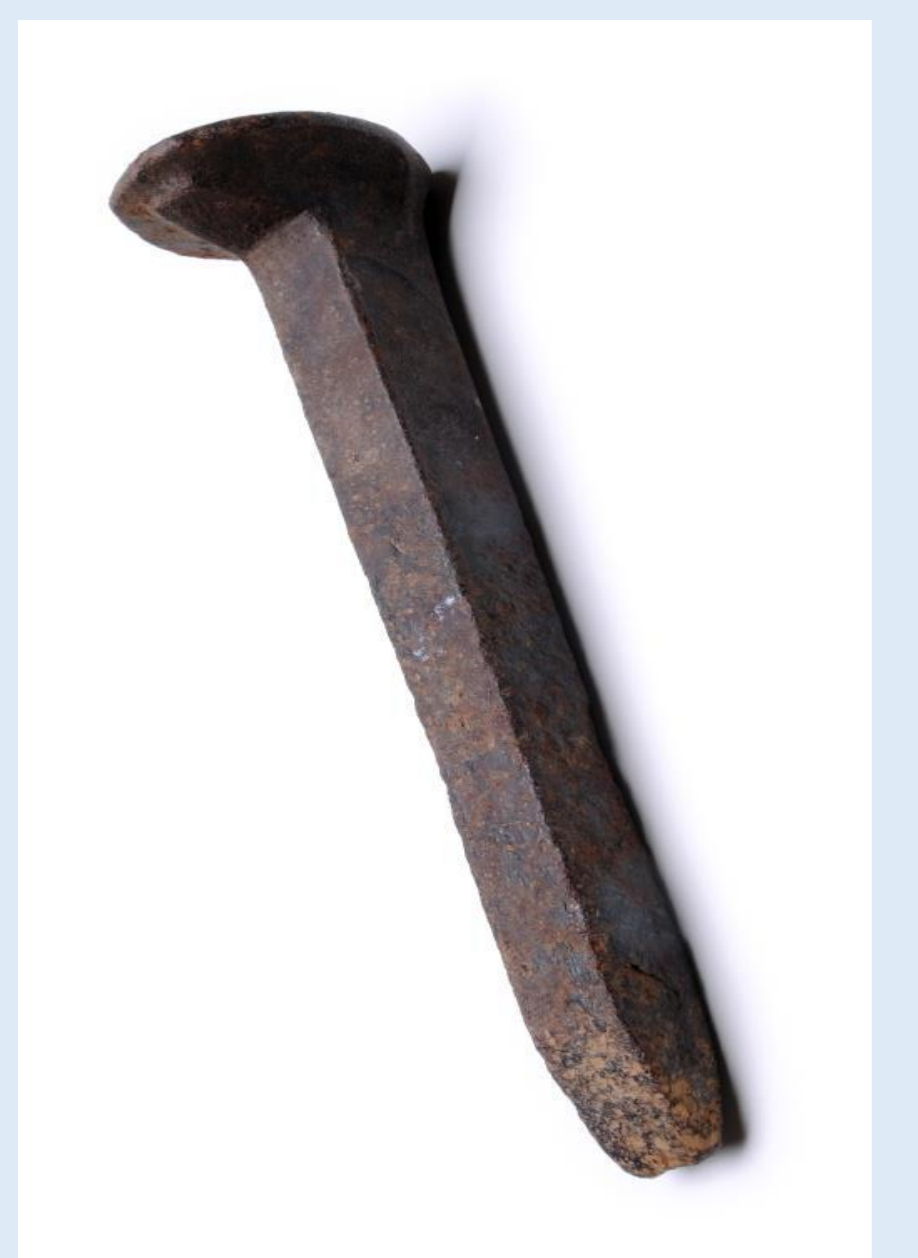
Railroad spike recovered from Catoctin Furnace